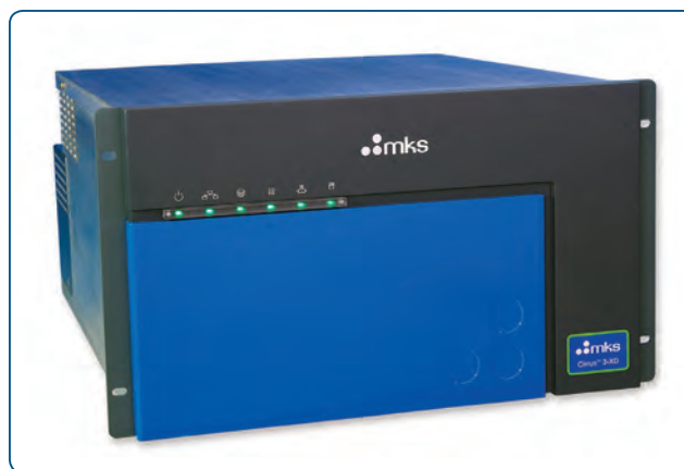
Cirrus 3-XD 6U rack-mount configuration