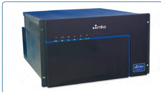
Cirrus 3 rack-mount configuration